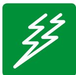
Energy & Power-Generation