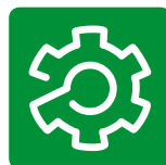
Industrial Process Control