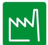
All Industrial Applications