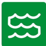
Water Treatment & Desalination